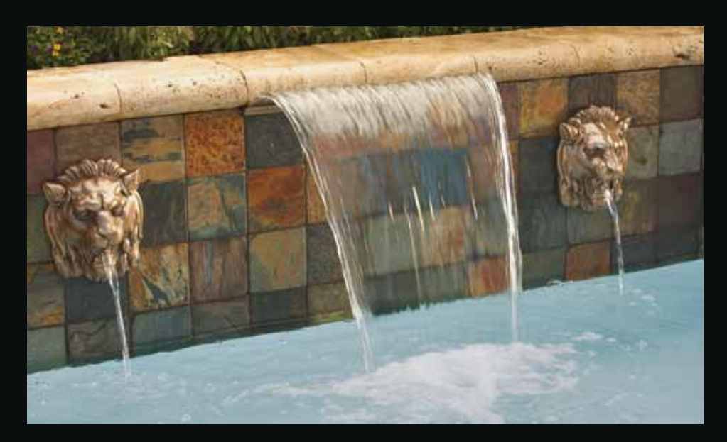
Arc Sheet Waterfall Effect

The arc sheet effect propels a smooth arc of water that projects up and away from the pool wall.